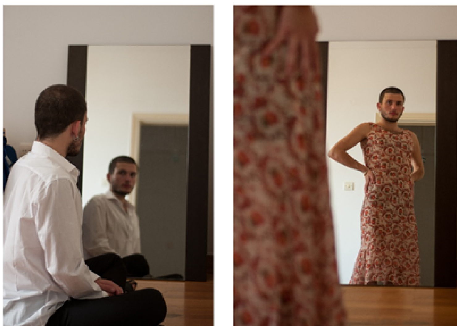
Figure 1: Markos Tsiklis ~ Mirror of Change (1st award)